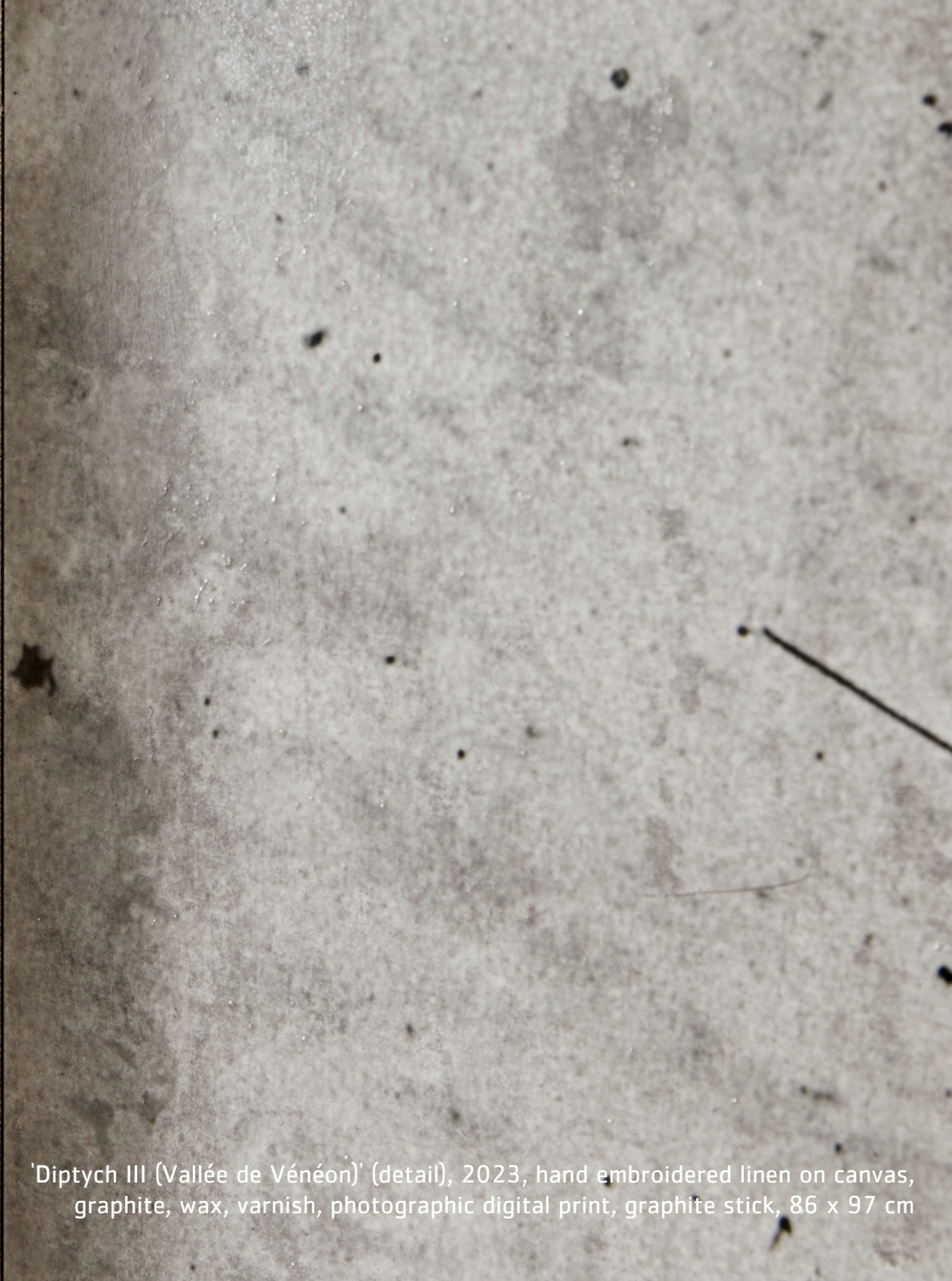
'Diptych III (Vallée de Vénéon)' (detail), 2023, hand embroidered linen on canvas, graphite, wax, varnish, photographic digital print, graphite stick, 86 x 97 cm