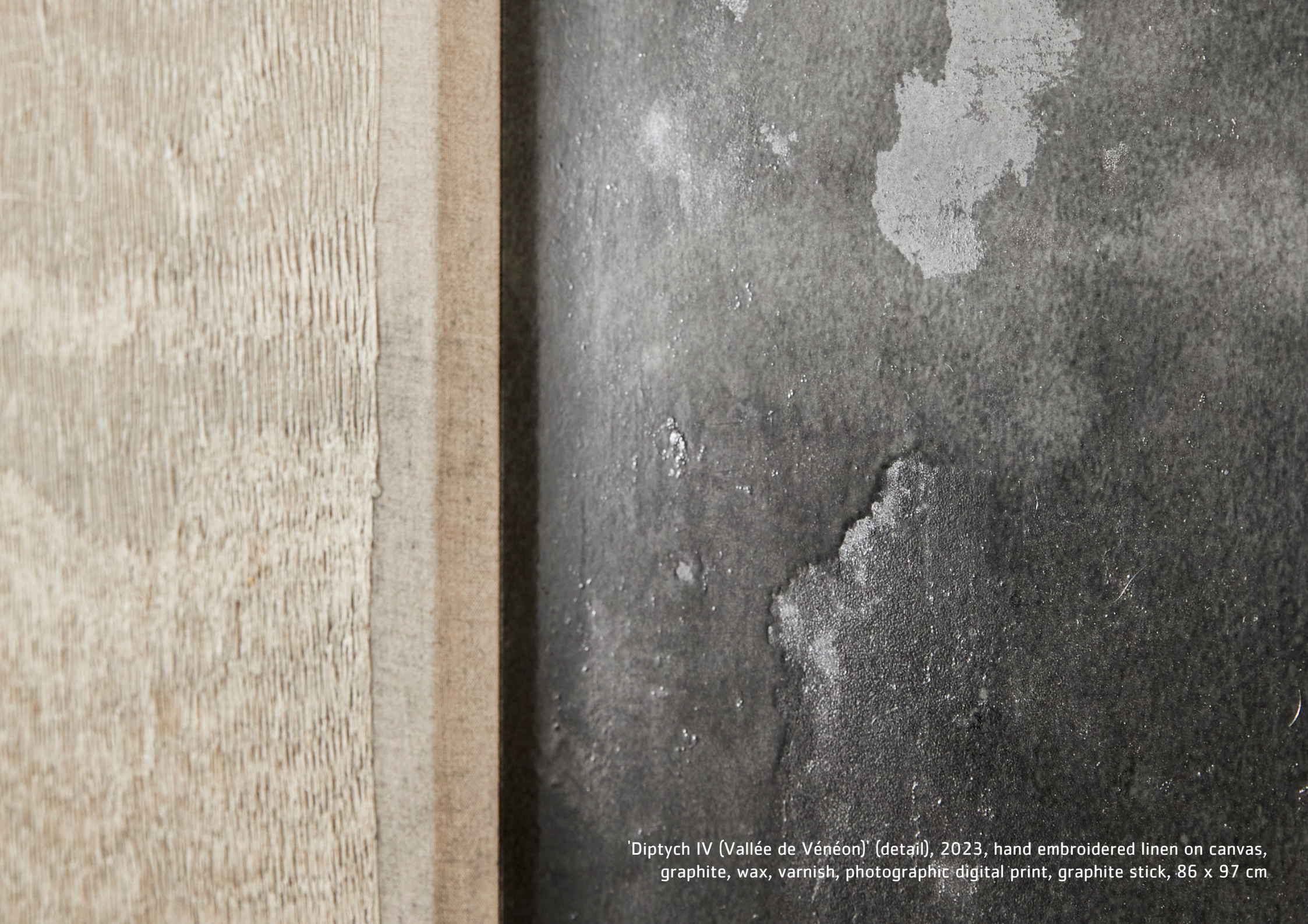
'Diptych IV (Vallée de Vénéon)' (detail), 2023, hand embroidered linen on canvas, graphite, wax, varnish, photographic digital print, graphite stick, 86 x 97 cm