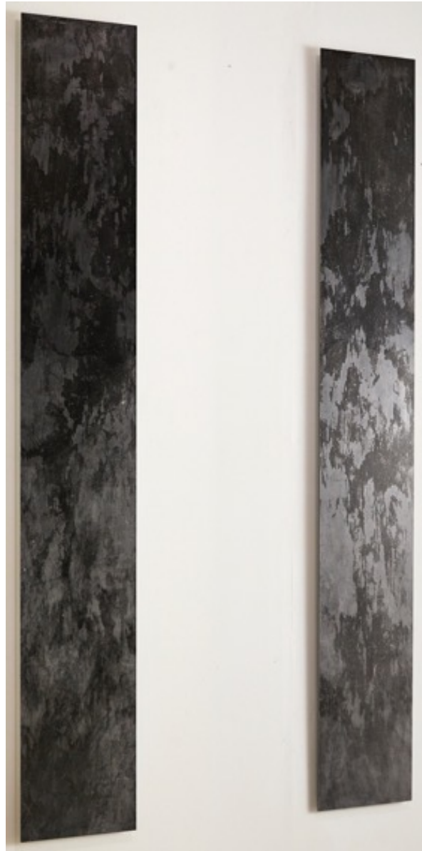
'Sliver Diptych (Vallée de Vénéon)', 2023, Photographic digital print on 300gsm paper, graphite, wax, varnish, graphite stick, 168 x 25 cm each panel, $5,500.