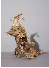
'Cognition 3', 2019, bronze, 44 x 42 x 40 cm, unique