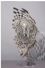
'Tessera 6', 2018, stainless steel, 107 x 39 x 13 cm, edition of 12 + 1AP