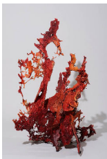
'Cognition 1', 2019, bronze, 128 x 90 x 98 cm, unique