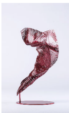
'I Am-Dancer', stainless steel, red polychrome, 69 x 38 x 39 cm, edition of 12 + 1AP