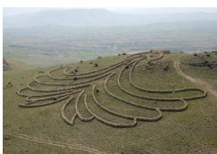
'Sustenance, Turkey', 2009, C-Print, Diassec Face, 102 x 130 cm, edition of 12 + 1AP