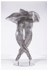
'Embrace', 2018, stainless steel, 160 x 109 x 65 cm, edition of 7 + 1AP