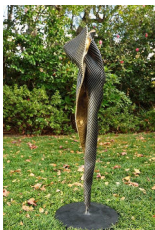
'I Am IV', 2016, bronze, 102 x 30 x 25 cm, edition of 12 + 1AP