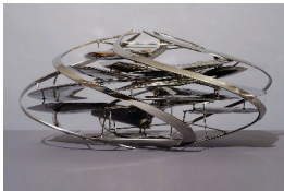
'Floating 3', 2018, stainless steel, 37 x 65 x 53 cm, edition 1 of 12 + 1AP