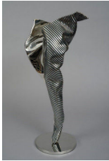
'I Am', 2014, stainless steel, 65 (H) x 31 (W) x 25 (D) cm, edition of 5 + 1 AP