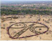
'Shield, Kenya', 2010, C-Print, Diassec Face, 102 x 130 cm, edition of 12 + 1AP