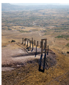
'A Day on Earth', 2011, C-Print, Diassec Face, 130 x 102 cm, ed. of 12 + 1AP