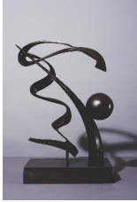
'Rhythms of Life', 2007, bronze, 117 x 85 x 45 cm, edition of 12 + 2AP