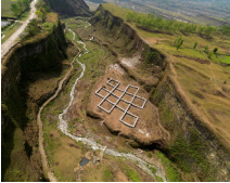
'Knot, Nepal', 2008, C-Print, Diassec Face, 102 x 130 cm, edition of 12 + 1AP