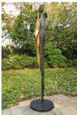
'I Am I', 2016, bronze, 240 x 42 x 35 cm, edition of 12 + 1AP