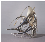
'Floating 6', 2018, stainless steel, 41 x 65 x 57 cm, edition of 12 + 1AP