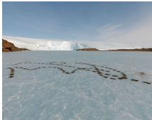
'Rhythms of Life, Antarctica', 2010, C-Print, Diassec Face, 102 x 130 cm, edition of 12 + 1AP