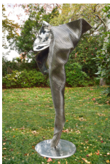
'I Am', 2015, stainless steel, 160 x 70 x 52 cm, edition of 12 + 1AP