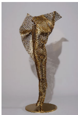
'I Am Open', 2019, stainless steel, gold polychrome, 150 x 66 x 56 cm, edition of 7 + 1AP