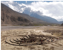
'Labyrinth, Nepal', 2008, C-Print, Diassec Face, 102 x 130 cm, ed. of 12 + 1AP