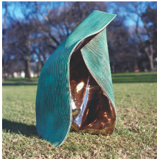
'Folded 3', 2003, bronze, 77 x 55 x 56 cm, edition of 12 + 1AP