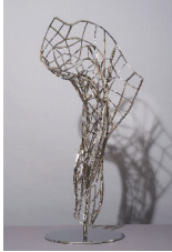
'Tessera 1 Negative', 2018, stainless steel, 107 x 46 x 27 cm, edition of 12 + 1AP