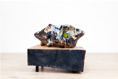
Claudia Terstappen, 'Planeta', 2018, glazed ceramic, wood ceramic, ca. 32 x 20 x 14 cm including wooden plinth that measures ca. 32 x 21 x 13 cm