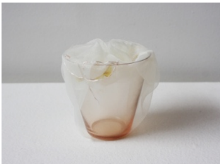
Kei Takemura, 'Renovated orange glass', 2014, Italian synthetic cloth, glass, Japanese silk thread, 8 x 7 cm