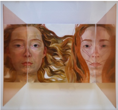
Natasha Walsh, 'Janus', 2018, oil on copper, Perspex box, 30 x 28 x 18 cm