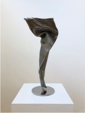
Andrew Rogers, 'I Am', 2014, stainless steel, 65 x 31 x 25 cm, edition of 5 + 1AP