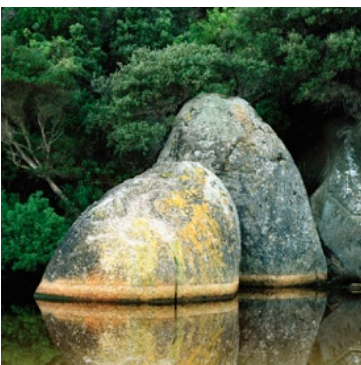
Claudia Terstappen, 'Rocks I', 2018, photograph on archival paper, framed, 95 x 95 cm, edition of 6 + 2AP