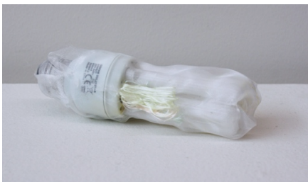
Kei Takemura, 'Renovated eco-light bulb', 2014, light bulb, Italian synthetic cloth, Japanese silk thread, 15 x 5 cm