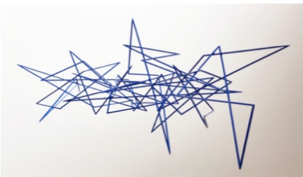
Kevin Osmond, 'Midnight Cloud', 2018, 3mm mild steel rod, French Blue industrial powder coating, piano wire, nylon filament, 28 x 101 x 31 cm