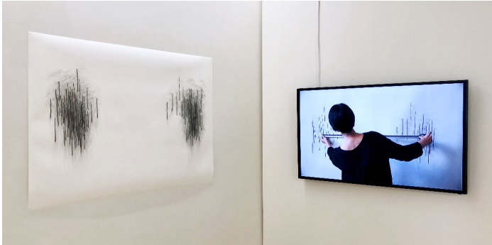
Sara Morawetz, 'Acts of Inexactitude III', 2019, charcoal on paper and single channel video with sound, 112 x 155cm, 21:16 mins, both works unique

07.02. – 21.02.19 Curated by Alanna Irwin