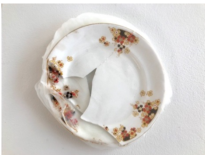
Kei Takemura, 'Renovated orange plate', 2015, Italian synthetic cloth, ceramic, Japanese silk thread, 24 cm diameter