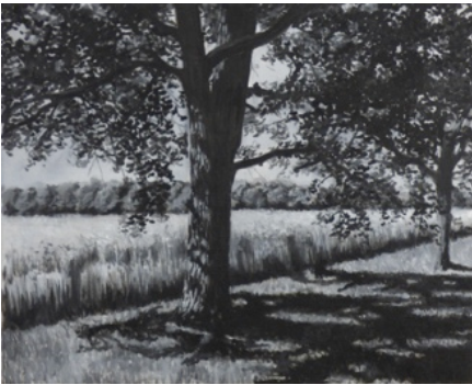
Stefan Thiel, 'Moenchshagen', 2018, 35 x 43 cm, oil on canvas