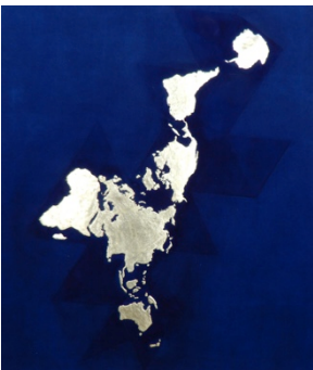
Desmond Lazaro, 'Dymaxion map IV (after Buckminster Fuller)', 2019, raised Water Gild Gold on South Indian Indigo dye cloth with natural pigment handmade by the artist, 60 x 70 cm