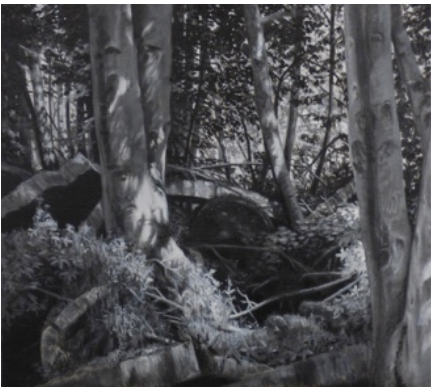
Stefan Thiel, 'Barth 1', 2018, 45 x 50 cm, oil on canvas