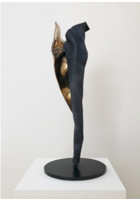
Andrew Rogers, 'I Am IV', 2016, bronze, 102 x 30 x 25 cm, edition of 12 + 1AP