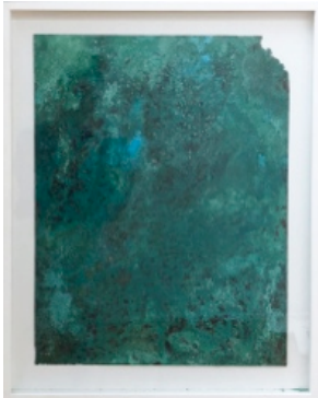
Kirtika Kain, 'ravines II', 2018, silkscreened bitumen on oxidised copper, 60 x 45 cm