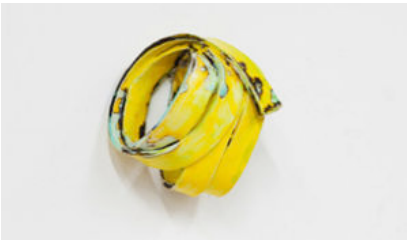
Claudia Terstappen, 'Gelb-turkis', 2018, glazed ceramic, ca. 8 x 10 x 10 cm