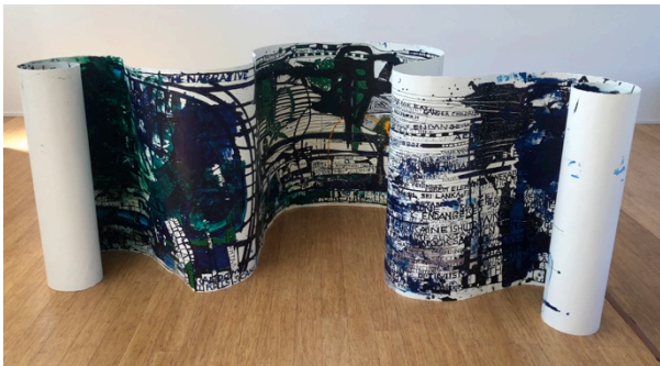
Locust Jones, 'Green Light in the Age of Extinction', 2019, ink on paper, 125 x 800 cm