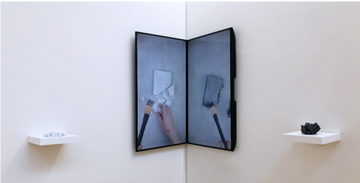
Emma Fielden, 'A Diminishing Force', 2019, two-channel HD video with stereo audio, 10:30 minutes, edition of 3 + 1AP; two sculptures, Queensland Bianca marble, ferrite magnet