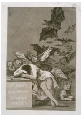
Francisco de Goya, 'El sueño de la razón produce monstruos [The sleep of reason produces monsters]', 1799, etching, aquatint, drypoint, and burin, 37 x 30 cm framed