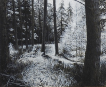
Stefan Thiel, 'Schwarzenpfost', 2018, 35 x 43 cm, oil on canvas