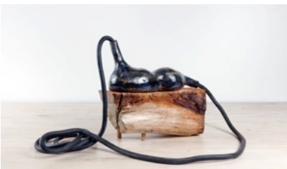
Claudia Terstappen, 'Tube bicho', 2018, glazed ceramic, ca. 36 x 13 x 17 cm plus 2 metres black tube, including wooden plinth that measures ca. 39 x 16 x 19 cm