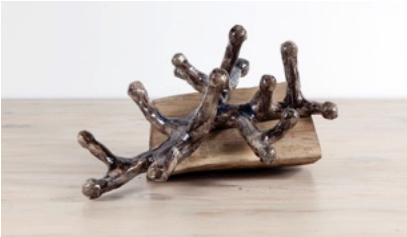
Claudia Terstappen, 'Gewächs (twin)', 2018, glazed ceramic, wood ceramic, ca. 34 x 26 x 13 cm, including wooden plinth that measures ca. 21 x 20 x 9 cm