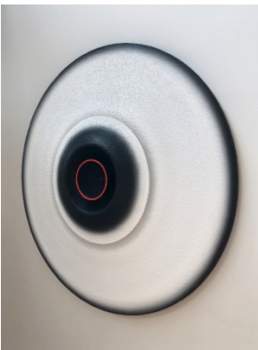
Marion Borgelt, 'Lune Lumina: No. 8', 2006, canvas, oil, texture, timber, 100 cm diameter x 12 cm deep