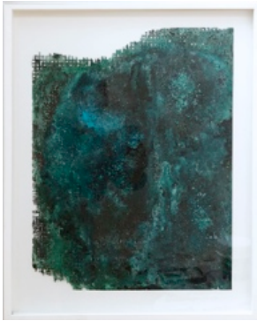
Kirtika Kain, 'ravines I', 2018, natural copper oxidation, beeswax and silkscreened bitumen on etched copper, 60 x 45 cm