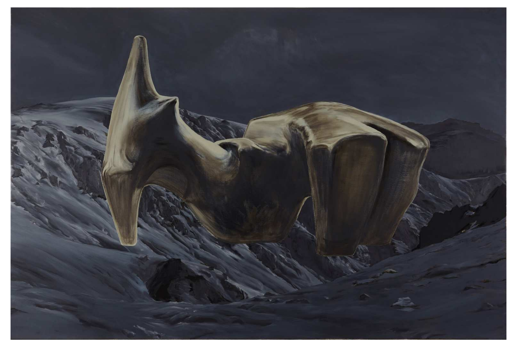
'Moonlit scrap', 2022, oil on linen, 182 x 122 cm, $7,500