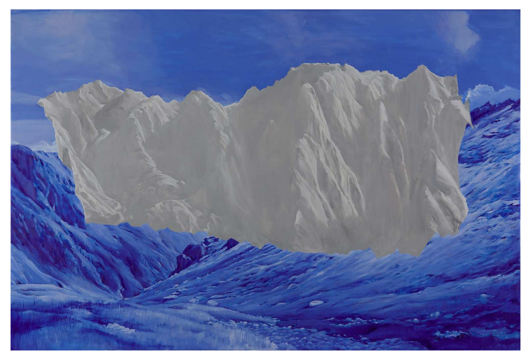
'lt's mountains all the way down', 2022, oil on linen, 182 \times 122 \text{ cm} , $7,500