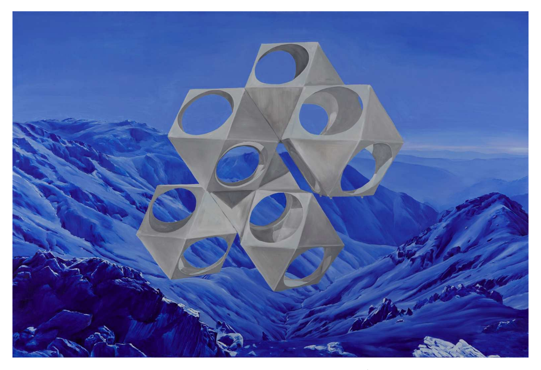
'Spielzeug schema', 2022, oil on linen, 182 x 122 cm, $7,500