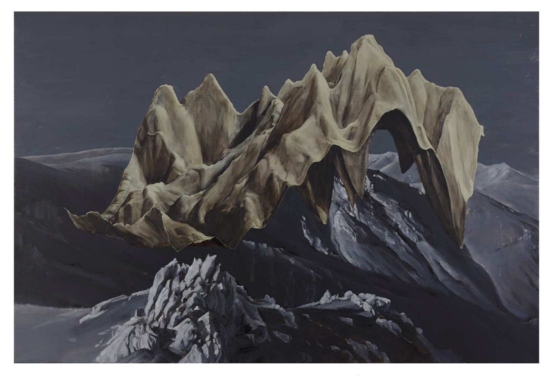
'Open sky', 2022, oil on linen, 182 x 122 cm, $7,500