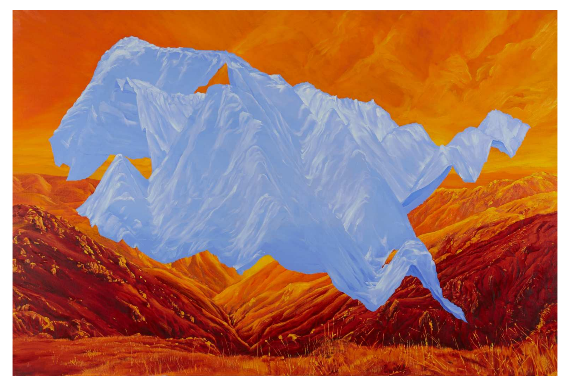
'Droste intermesh', 2022, oil on linen, 182 x 122 cm, $7,500