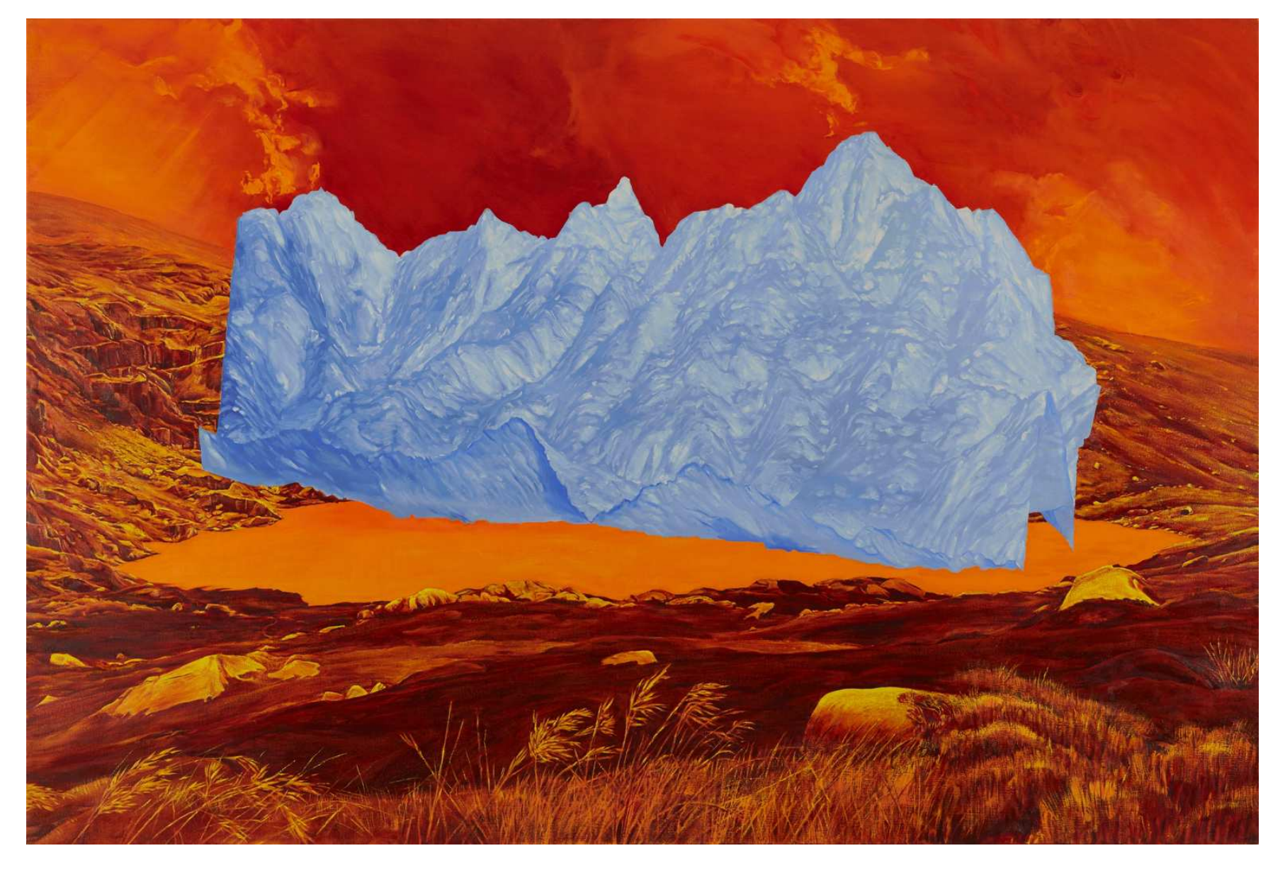
'Nelligen Orange,' 2022, oil on linen, 182 x 122 cm, $7,500