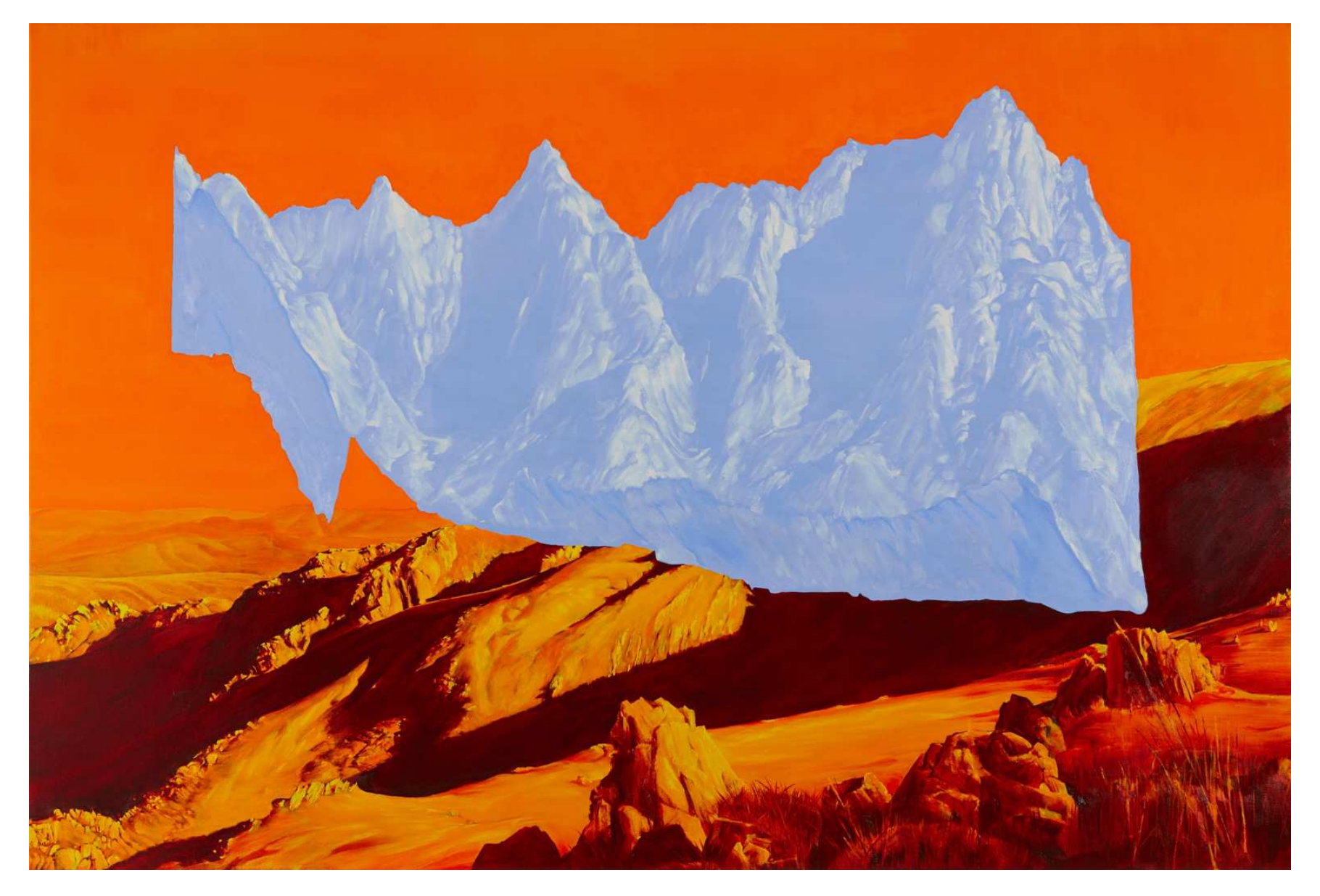
'Off planet', 2022, oil on linen, 182 x 122 cm, $7,500