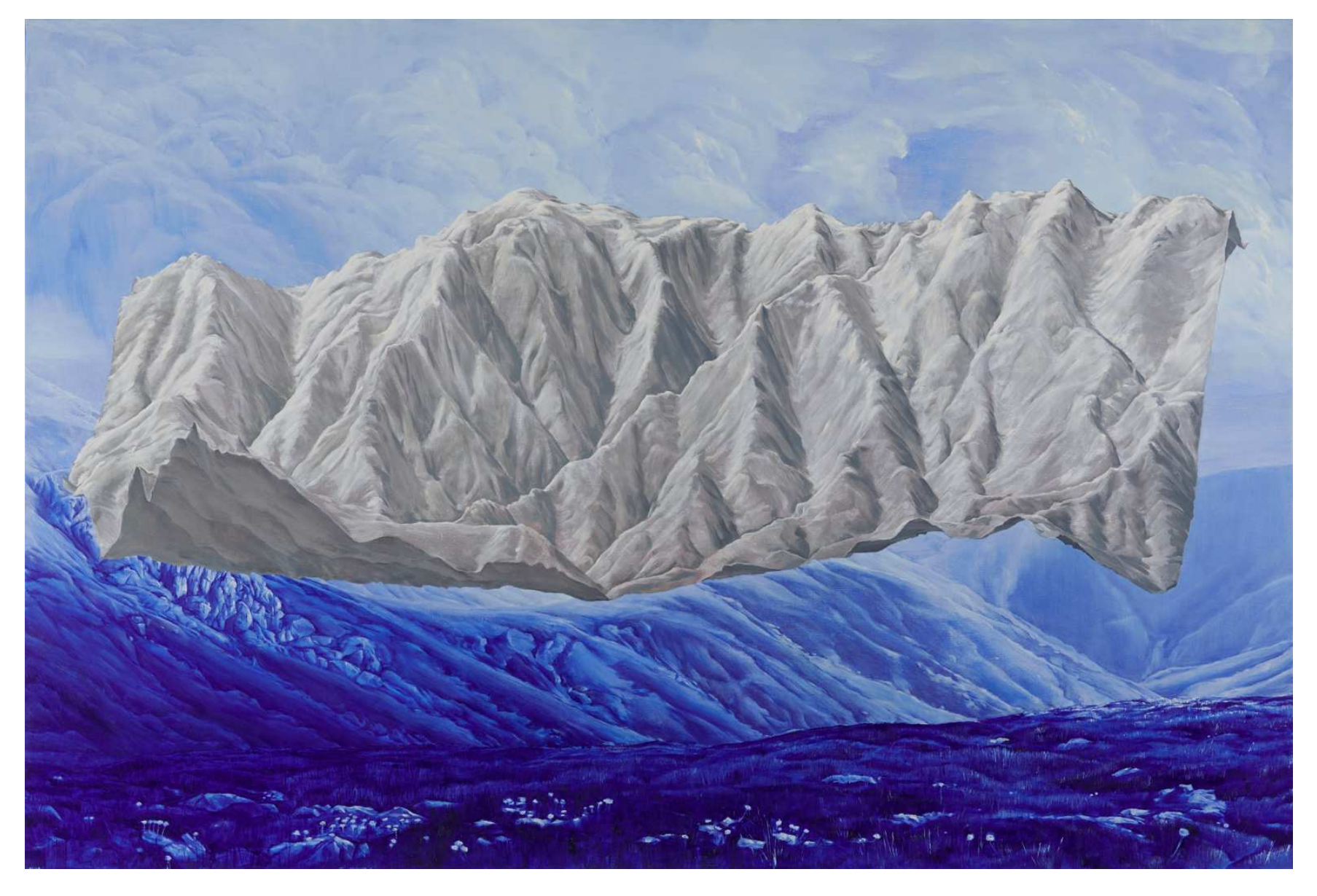
'Recursion: see recursion', 2022, oil on linen, 182 x 122 cm, $7,500