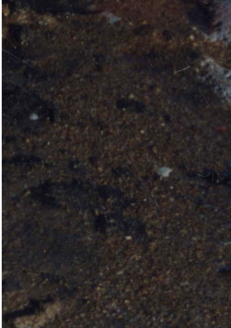
'Wet sand scratches', 2023, archival pigment print, 42 x 59 cm, edition of 3, $950