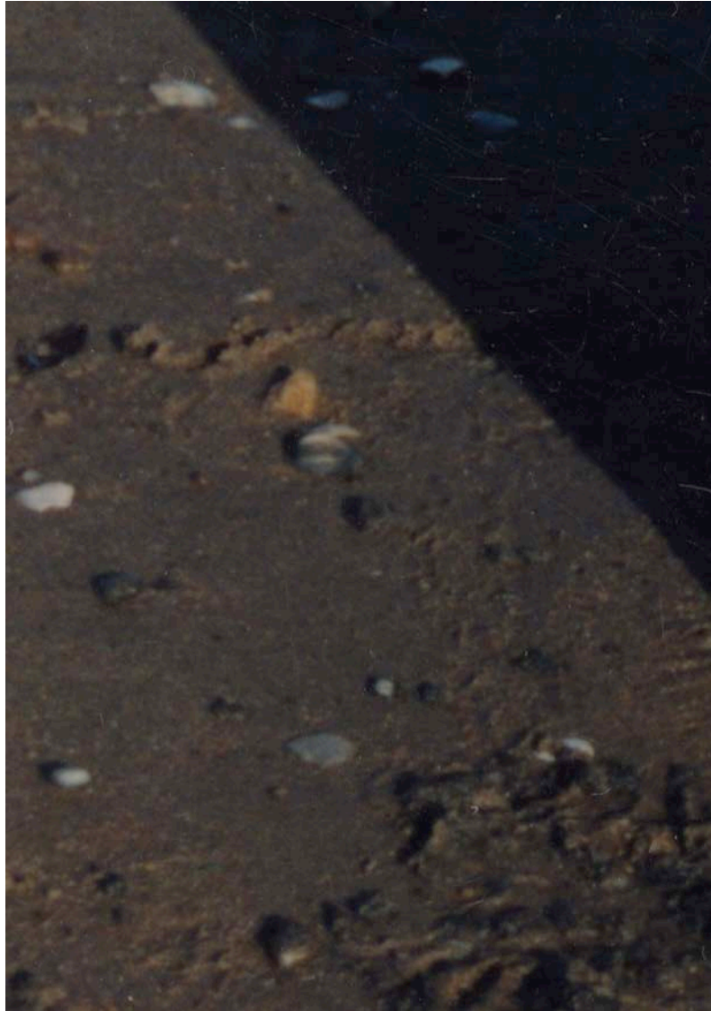
'Harsh shadow shells', 2023, archival pigment print, 42 x 59 cm, edition of 3, $950