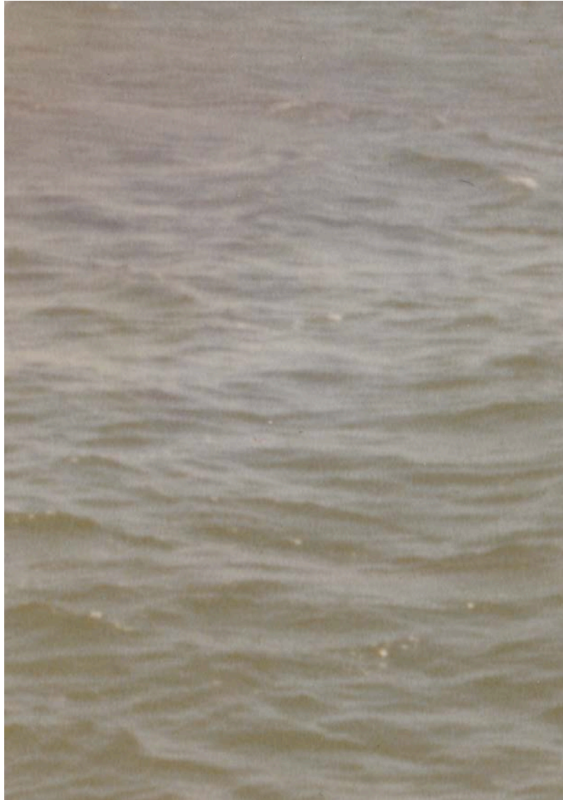
'Ocean', 2023, archival pigment print, 42 x 59 cm, edition of 3, $950