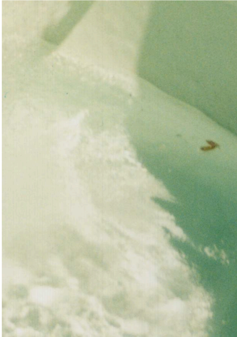
'Water tank leaf', 2023, archival pigment print, 42 x 59 cm, edition of 3, $950