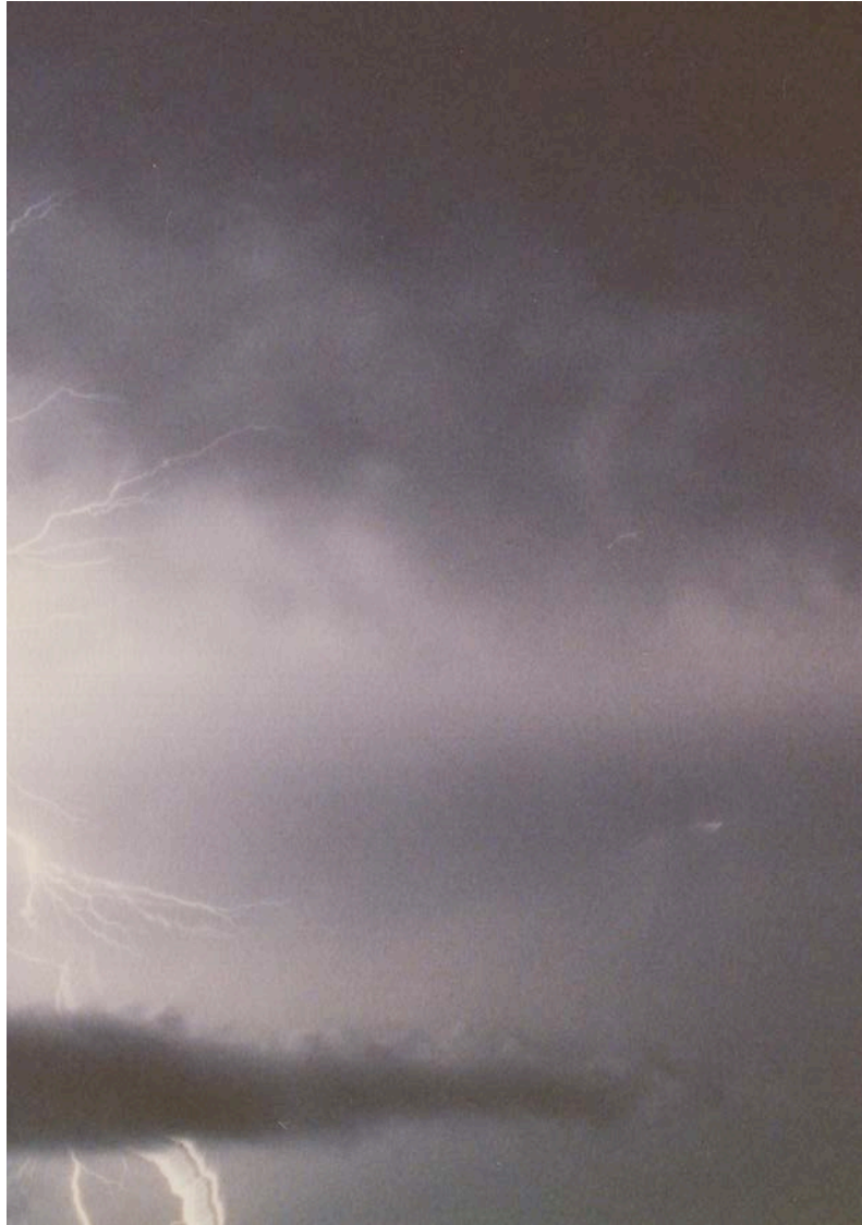
'Lighting', 2023, archival pigment print, 42 x 59 cm, edition of 3, $950