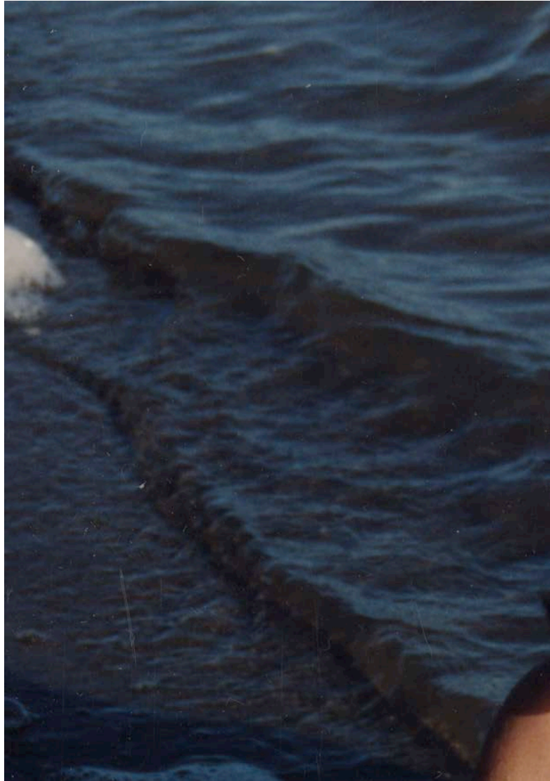
'Shoulder ripples', 2023, archival pigment print, 42 x 59 cm, edition of 3, $950