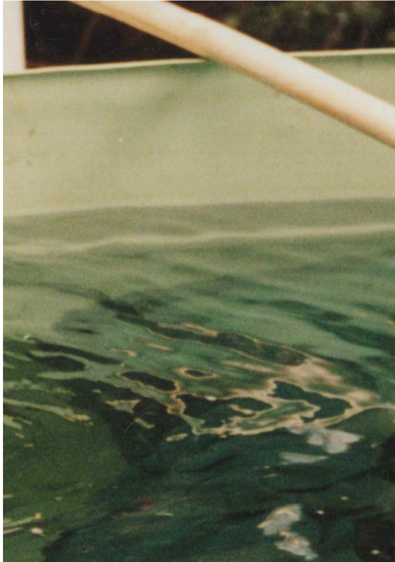
“Water tank pipes’, 2023, archival pigment print, 42 x 59 cm, edition of 3, $950