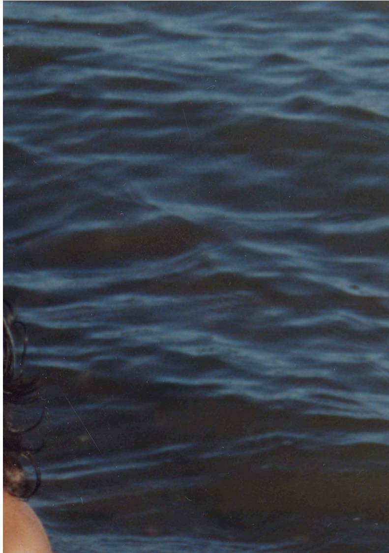
'Water curls', 2023, archival pigment print, 42 x 59 cm, edition of 3, $950