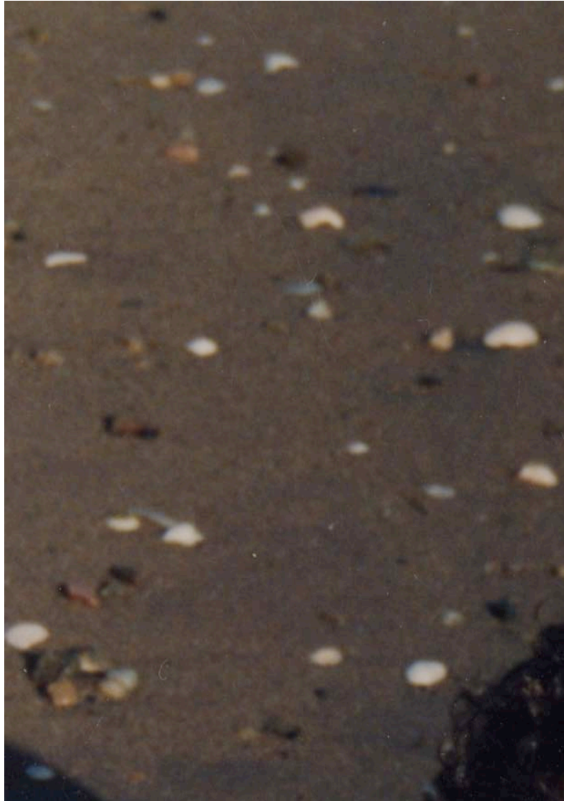
'Shells and shadow', 2023, archival pigment print, 42 x 59 cm, edition of 3, $950