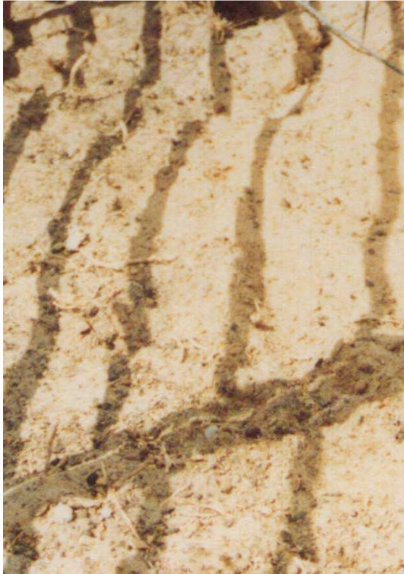
'Sheep yard shadows', 2023, archival pigment print, 42 x 59 cm, edition of 3, $950