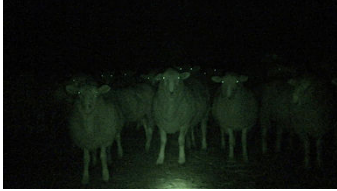
'There'll Be No More Shepherds' #1-10, 2018, pigment print face mounted to acrylic, 38 x 68 cm, edition of 5 + 1 AP