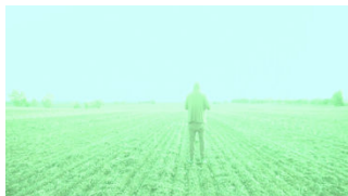
'Waiting', 2018, HD video, edition of 3 + 1 AP, 09:45 min