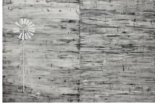
'The witch is well (The Windmill)', 2018, drypoint on Hahnemuhle 300 gsm paper, mounted on aluminium panel, 160 x 240 cm, edition of 3 + 1 AP