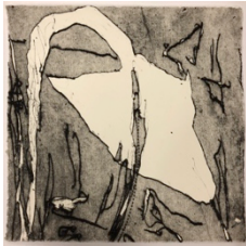
'The other side of stone', 2018, drypoint on Hahnemuhle 300 gsm paper, 25 x 25 cm, edition of 3 + 1 AP