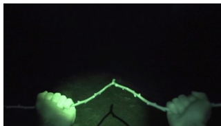
'The divine', 2018, HD video, edition of 3 + 1 AP, 04:20 min