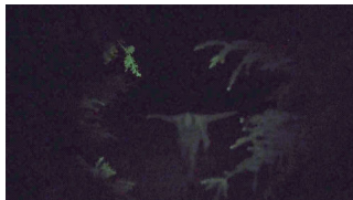
'The Shepherds Crook', 2018, HD video, edition of 3 + 1 AP, 02:17 min