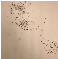
'Ricochet II' #1-6, 2018, stoneware ceramics and acrylic mirror, 50 x 50 cm