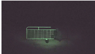
'The Gate', 2018, HD video, edition of 3 + 1 AP, 18:50 min