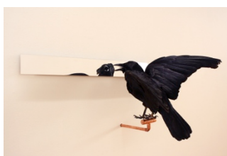
'Affirmations' #1-5, 2018, Taxidermy crows, acrylic mirror, copper