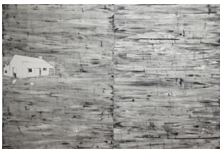
'The Ghost House', 2018, drypoint on Hahnemuhle 300 gsm paper, mounted on aluminium panel, 160 x 240 cm, edition of 3 + 1 AP