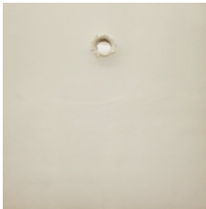
'Ricochet I' #1-5, 2018, Stoneware ceramics and acrylic mirror, 50 x 50 cm